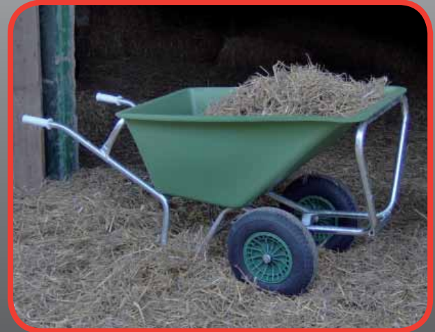
PEX-160 (2 Wheel)