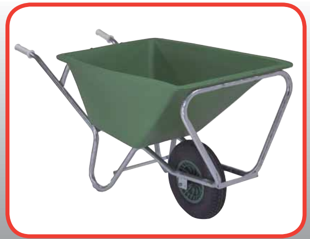
PEX-160 (1 Wheel)