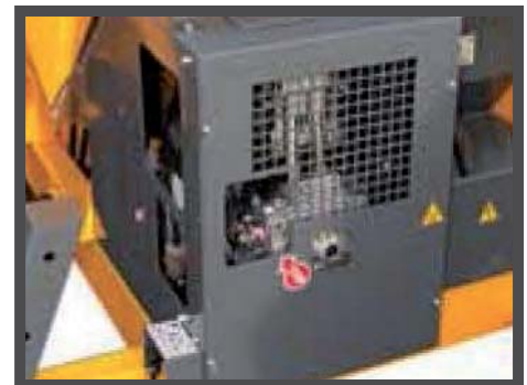
HATZ DIESEL GENERATOR