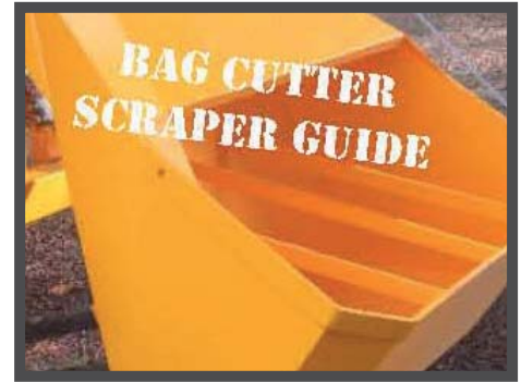
BAG CUTTER & SCRAPER GUIDE