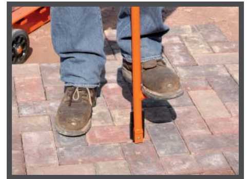
FOOT OPERATED MECHANISM FOR EASE OF USE