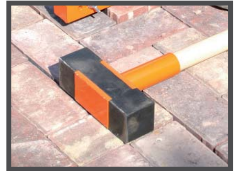
HEAVY DUTY RUBBER PREVENTS BLOCK DAMAGE