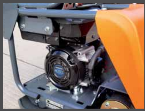
EMISSION FREE, LOW NOISE, BATTERY POWERED HONDA EGX MOTOR