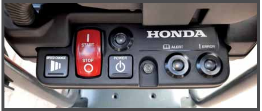
SIMPLE, SINGLE SWITCH OPERATION MAKES STARTING THE POWER UNIT EASY. 3-SPEED SELECTOR.