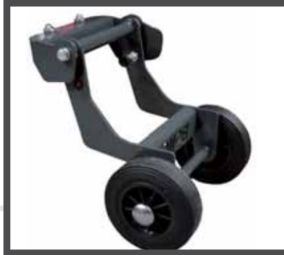
OPTIONAL WHEEL KIT IS AVAILABLE