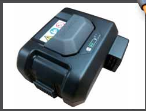
LI-ION BATTERY, INTERCHANGEABLE WITH OTHER HONDA eGX POWERED ALTRAD BELLE PRODUCTS