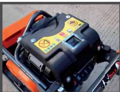
ROBUST, PROTECTIVE BATTERY COVER, WITH STEEL SUB-FRAME