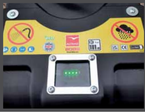
BATTERY POWER LEVEL INDICATOR ALWAYS VISIBLE FROM OPERATING POSITION