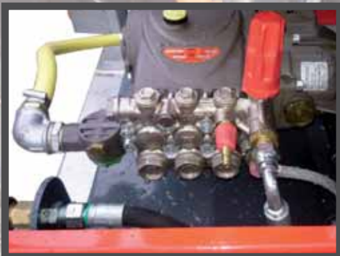
HIGH QUALITY TRIPLE PISTON PUMP WITH THERMAL PROTECTION & INLET STRAINER