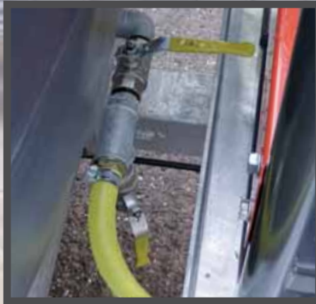
TANK AND PUMP DRAIN TAPS FOR SAFE TRANSPORTATION & PREVENT FROST DAMAGE