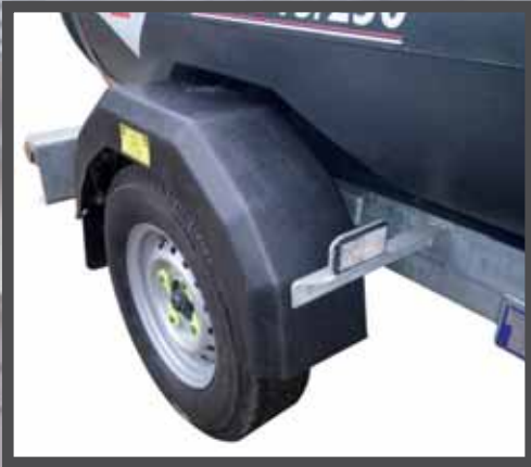
MOULDED MUDGUARDS, SIDE REFLECTORS & WHEEL NUT INDICATORS