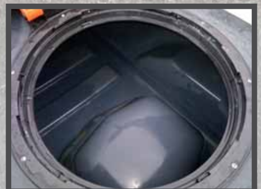
GENEROUS 550MM TANK MOUTH & INTERNAL TANK BAFFLE