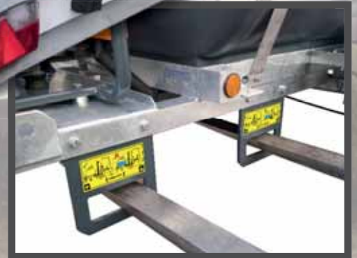
FORKLIFT POINTS FOR SAFE ON-SITE TRANSPORTATION