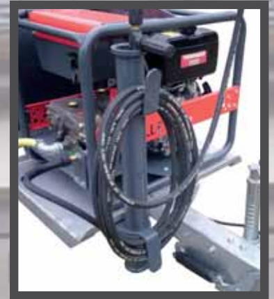
LANCE HOLDER INTEGRATED INTO THE TRAILER WITH HOSE STORAGE HOOKS