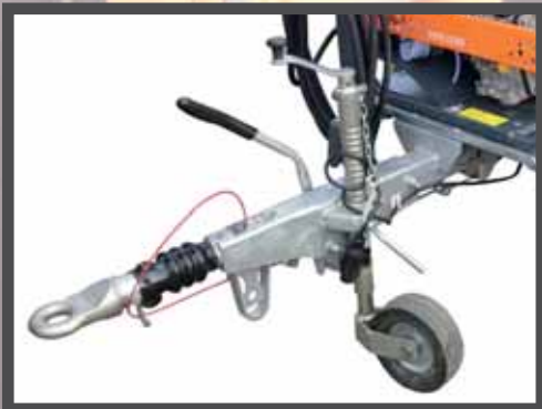
40MM TOWING EYE, BREAK-AWAY CABLE & TELESCOPIC JOCKEY WHEEL / JACK (OPTIONAL 50MM BALL HITCH ALSO AVAILABLE)