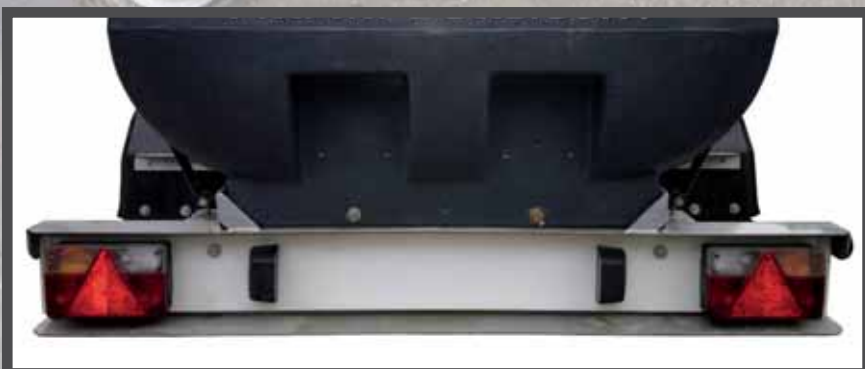
INTEGRATED LIGHTING EQUIPMENT COMPLETE WITH 13-PIN PLUG AND 7-PIN ADAPTOR